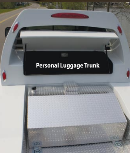
Personal Luggage Trunk