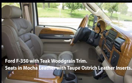
Ford F-350 with Teak Woodgrain Trim. Seats in Mocha Leather with Taupe Ostrich Leather Inserts.

For photos, options, and pricing: www.SelectDesignVehicles.com • 866.860.0866