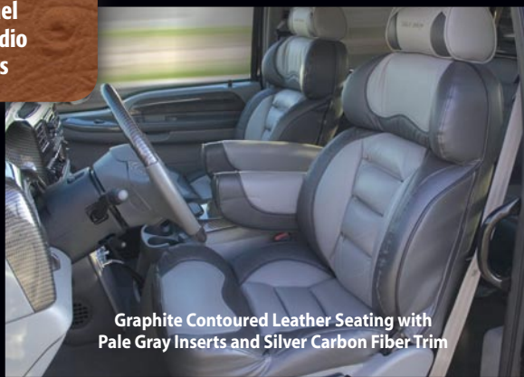
Graphite Contoured Leather Seating with Pale Gray Inserts and Silver Carbon Fiber Trim