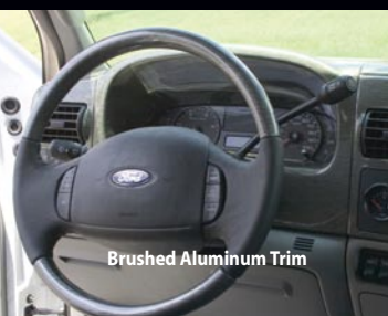
Brushed Aluminum Trim