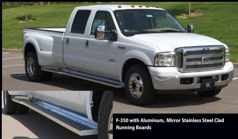
F-350 with Aluminum, Mirror Stainless Steel Clad Running Boards