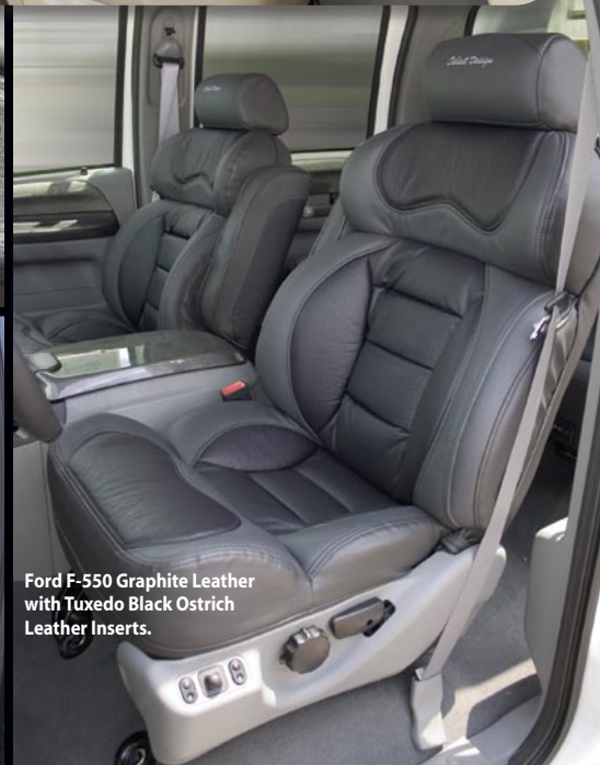
Ford F-550 Graphite Leather with Tuxedo Black Ostrich Leather Inserts.